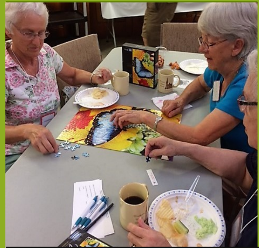
Lunch & Learn's June 'Jumping into Summer' event

For more information, visit our website or follow us on Facebook! Forms can be found online or by visiting the House of Lazarus, any Dundas Branch of the SDG County Library, or the South or North Dundas municipal offices.