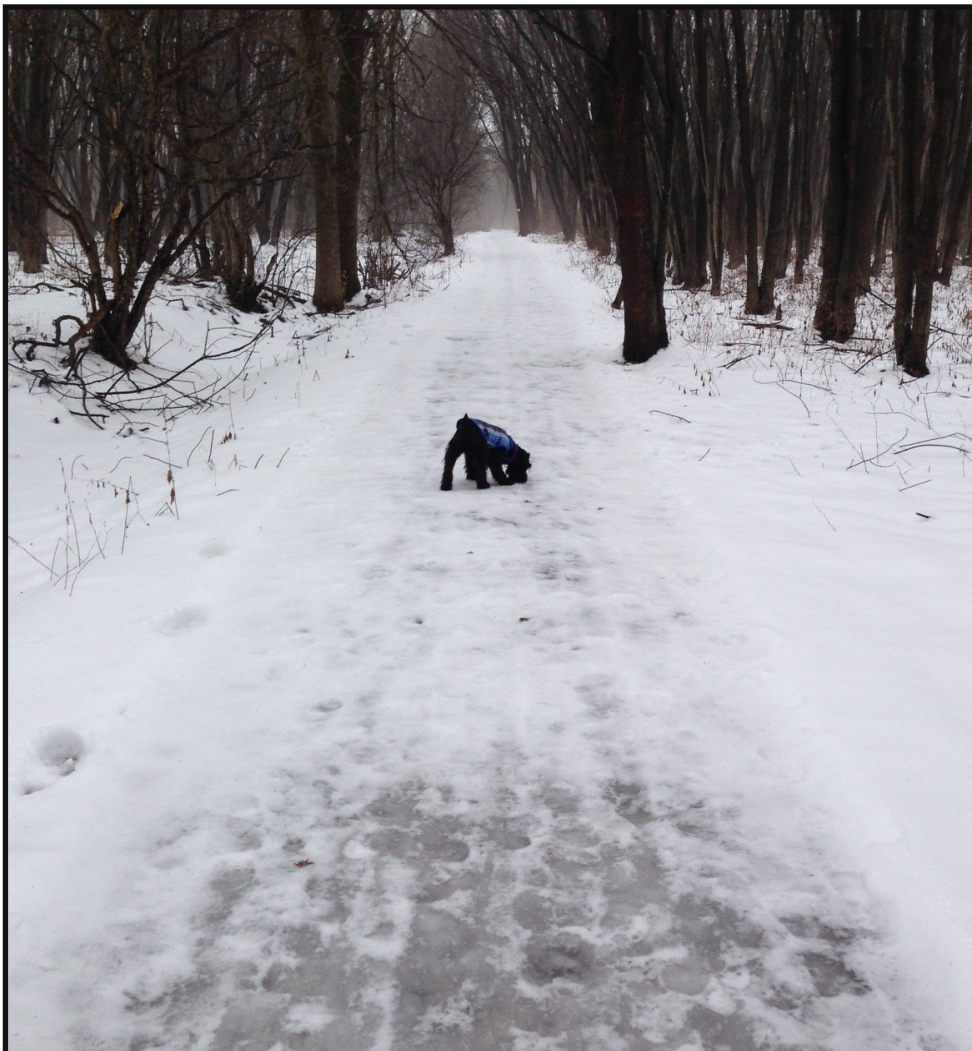
Julie Graham Dundas County Photo Contest—Walking Trails Category (Two Creeks Forest Trail with Ozzy)