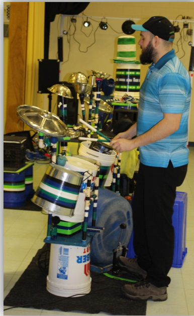
Above: The event's biggest hit was a Junkyard Symphony performance on March 14. This was sponsored by Winchester's Main Street Clothing.

In addition to Vanderlaand the Barnyard Zoo, Tribeck Inflatables, and Maple Ridge's Glow Party Room, Linking Hands welcomed several agencies that also provided lots of fun activities for children, including Community Living Dundas County, Glengarry Inter-Agency Group's Early ON, Happy Face Nursery School, and SDG Library. Other exhibitors included Eastern Ontario Health Unit, Jambel Cuisine, Job Zone, Knowledge First Financial, Maison Interlude House, Naomi's Family Resource Centre, Victim Services of SDG & Akwesasne.