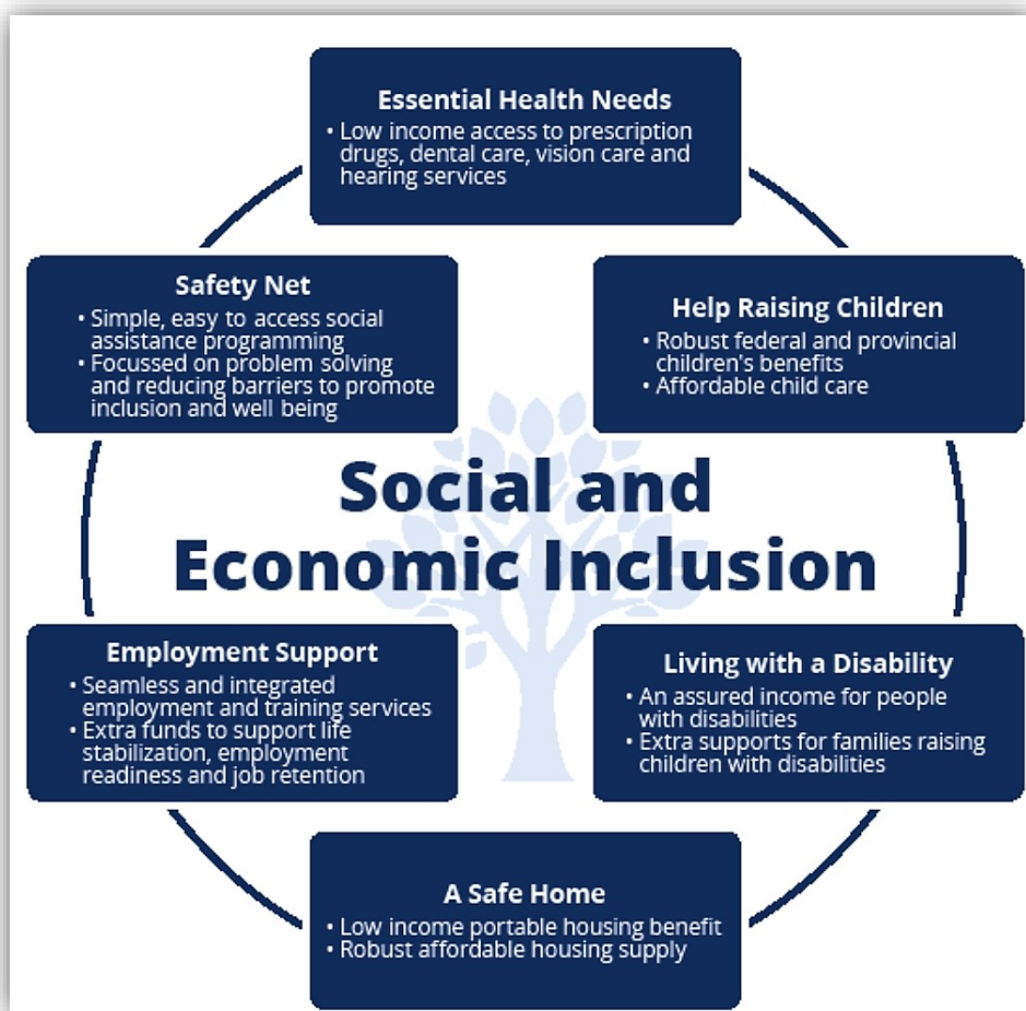
Diagram from Page 62 of Ontario's Income Security: A Roadmap for Change

"All individuals are treated with respect and dignity and are inspired and equipped to reach their full potential. People have equitable access to a comprehensive and accountable system of income and in-kind support that provides an adequate level of financial assistance and promotes economic and social inclusion, with particular attention to the needs and experience of Indigenous peoples.